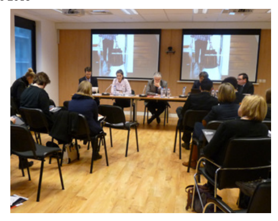
Millennial Dialogue seminar

FEPS and CAP launched the "Millennial Dialogue" as a transatlantic initiative to engage with and better understand the priorities and values narrative of those aged between 15 and 34. These dynamics have proved very interesting with established parties faltering when attracting younger voters, but evidence of growing activism in non-party political movements and other civil society organisations. This project began with a large international survey on millennial values, using innovative and sophisticated methodologies to gain insights often absent from political discourse. This research aims to provide a basis for a comprehensive millennial policy agenda, one that interacts with young people rather than accepting their loss from the political process. The main focus of the project is many European countries, and stretches also to the USA.