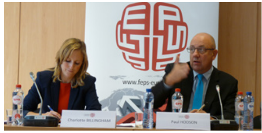
Paul Hodson, European Commission DG Energy Efficiency

September 8<sup>th</sup>, Brussels I Presentation and discussion With Paul Hodson, Head of unit for energy efficiency in DG energy at the European Commission. Ahead of the EU Council summit in October due to address energy efficiency as a priority the discussions looked at the current state of play of the proposals from the Commission and upcoming issues in this area. The debate gathered a large audience of stakeholders from the energy sector in Brussels.