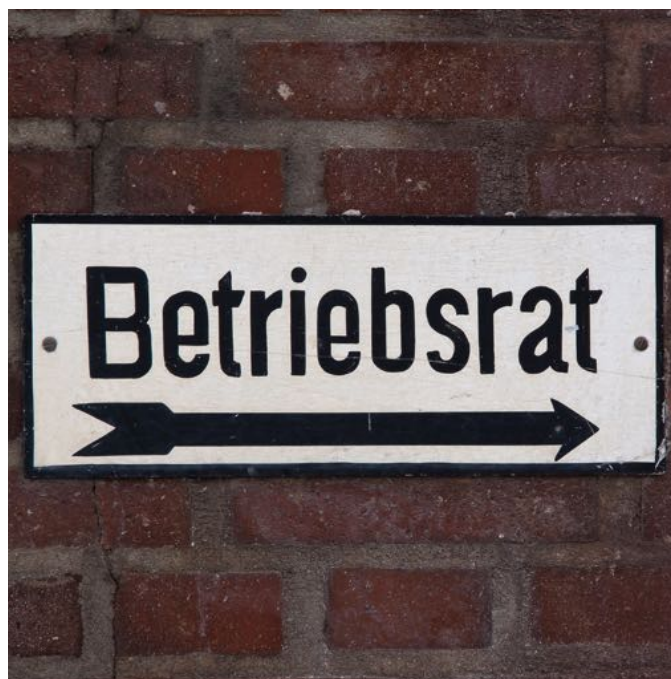
A sign indicating a German works council.

Across these conversations, one lesson has stood out that is relevant to how Labour develops securonomics to address the needs of workers in a changing economy. This is that attaining security at