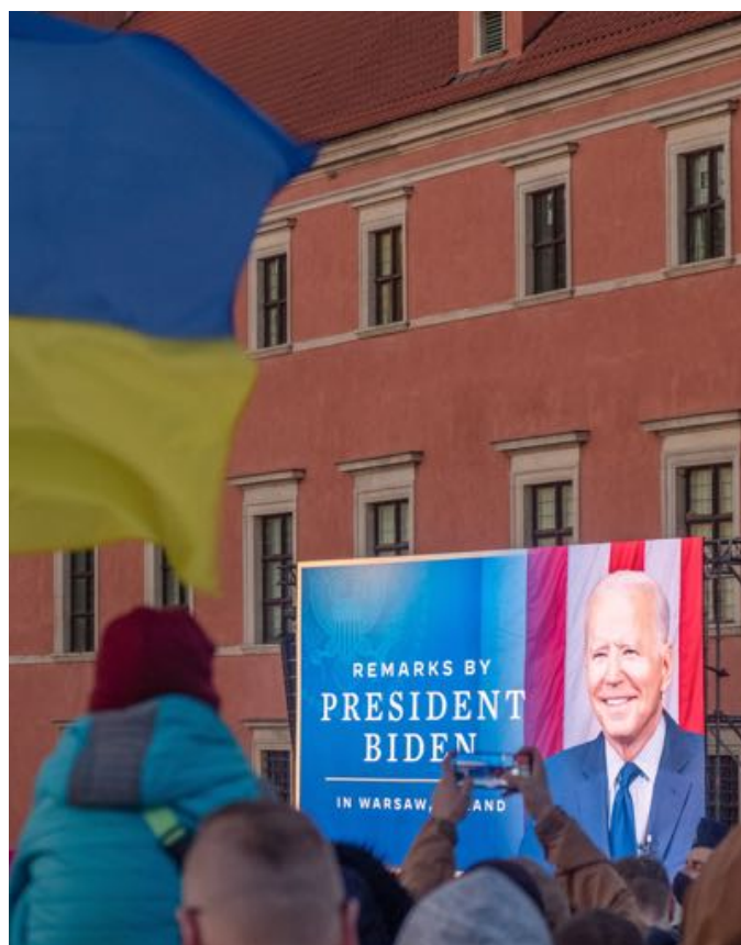
President Biden making a public appearance in Warsaw.

direction. In this sense, Bidenomics impacts not only individual member states but the EU as a whole. European states now face the balancing act of responding through a policy arsenal of their own without, in turn, fragmenting the Western economic and political bloc at the onset of what some commentators characterise as a “new Cold War”, from which China and Russia could be the beneficiaries. The aim is to ensure that strategic advantage in specific sectors can be spread evenly across allies so that the Western bloc is not divided by competition. The dilemma is how much of the response to this changing terrain should be concentrated at the level of the nation state or at the level of the EU or other alliances and partnerships.