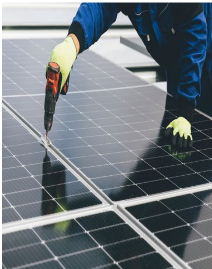
Installation of solar panels.

There has been plenty of thought across the centre-left in Europe and elsewhere about “derisking” the overall business environment within which these industries operate. The substantial risks these innovations incur for firms and investors appear to demand government support for R&D and strong signalling for a wider strategic push for clean growth that can create a sense of stability and security for business.