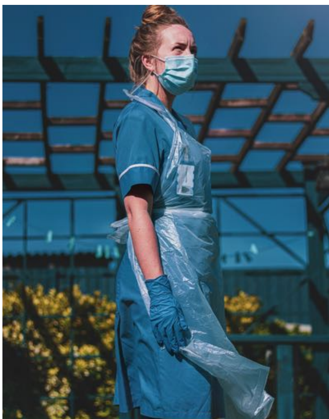
Critical worker in the care sector.