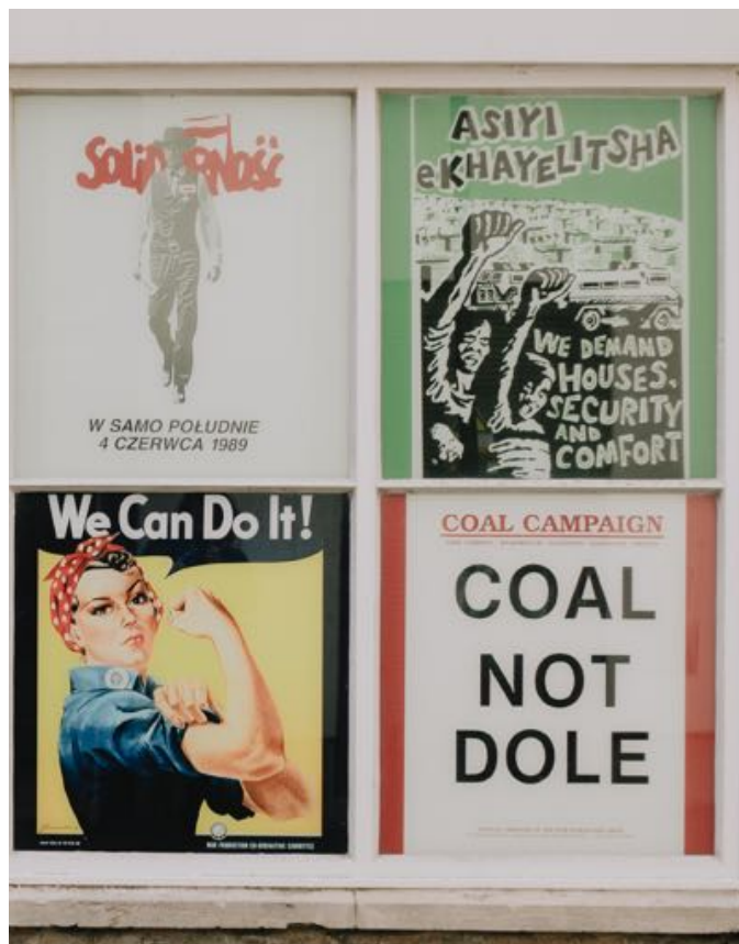
Posters from the Cold War era.

In this sense, we suggest social democrats should continue reorganising their policies and strategic