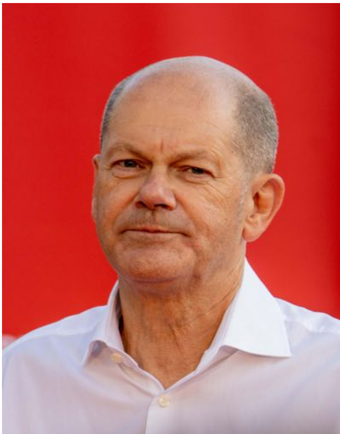
German Chancellor Olaf Scholz.

This is associated with the centrality of the concept of "respect" to Scholz's election-winning platform. 81 In the context of shrinking fiscal space for traditional compensatory and redistributive measures, a social democratic agenda can be stretched to breaking point as it seeks to satisfy the sometimes contradictory positions of divergent voter blocs. The universal appeal represented by "respect" enabled the SPD to sidestep this trap, articulating across professional and occupational differences the basic needs of human dignity shared in common, naming something that a broad range of workers found lacking in order to rebuild trust. Respect was rhetorically presented in terms of an abstract "values offer" but then made concrete in practical policies on wages and pensions that afforded voters genuine material gains. 82 The two sides – moral and material – were not in tension, but intertwined, dignity respected and recognised rhetorically as well as in terms of remuneration. This had at its heart a notion of quality of work for essential and unskilled workers – those workers foundational to