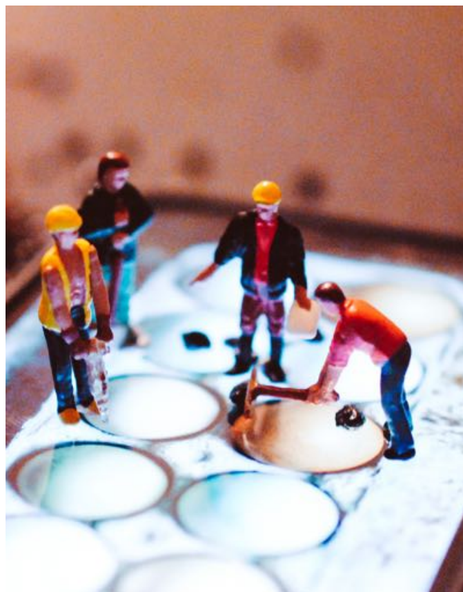
Mining critical metals for phones.

At one roundtable, we heard of the danger that the green agenda is presented a quantitative job creation scheme that ultimately appears abstract and remote from the realities of work as it exists