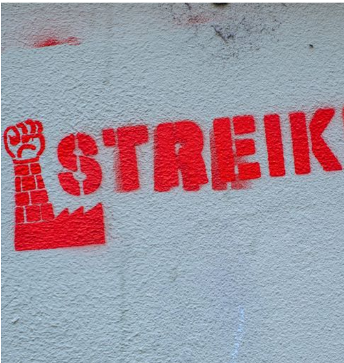
Strike graffiti.

Pitched in this way, Labour's agenda goes with the grain of several profound social, political and