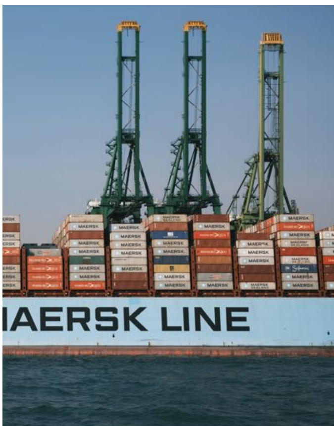
The image of globalisation: cargo ship with containers.

The complexity of the task ahead is addressed in a recent paper by the Tony Blair Institute for Global Change. 51 This argues that, rather than bringing back traditional manufacturing industries, which, in an age of technological transformation, cannot sustain the number of well-paying jobs they did previously, it is better to focus on developing an industrial strategy that stimulates the skills, infrastructure and R&D needed to power specific areas of innovation in