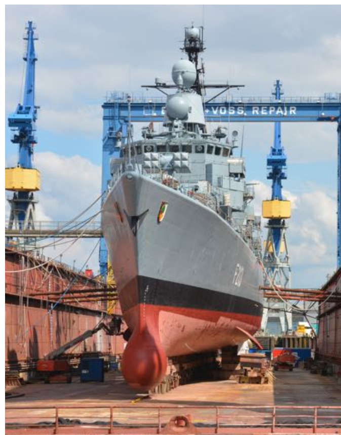
Shipyard in the defence industry.

Whilst the UK government can credibly claim to have made an important contribution to Ukraine’s war effort, its flawed approach to defence procurement