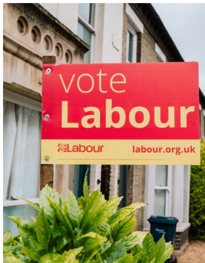
UK Labour Party campaign placard.

In short, the argument we have developed over the course of the three roundtables and set out here is that the conceptual underpinning of Labour’s programme for government – and that of social democrats elsewhere – in a notion of security is correct, answering the “first political question” of keeping citizens safe. The key challenge is building a consensus on the meaning of “safe” and how it, as an end, can be achieved in the world of work and the broader sense of economic, national and international security. Once we look at things at these different dimensions, it becomes clear that security