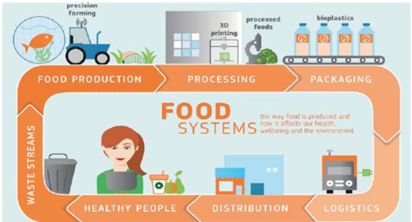
Figure 1. An overview of the EU food system.

food provisioning systems (Steffen et al. 2015). At the same time, as the climate crisis is intensifying and ecosystem services are declining, the global demand for food is increasing by an estimated 50% by 2050, according to FAO (2014) and the UN, putting an additional burden on food provisioning systems. Strategies to avoid or minimise negative ecological impacts of the food system, according to FAO (2014), must consider the following areas: animal and plant health; biodiversity and ecosystem services; climate change mitigation; the carbon footprint; air quality; water quality; soil quality; land use; and demand side policies, e.g. to decrease