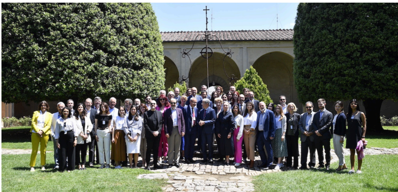
Siena Conference fourth Edition 2023.

Scientific partners of Vision will be The University of Siena and The European University Institute , to which the EU gave the task of promoting the academic debate on relevant topics for the European institutions. The Institute of European Policy Making at Bocconi will chair two sessions of the conference.