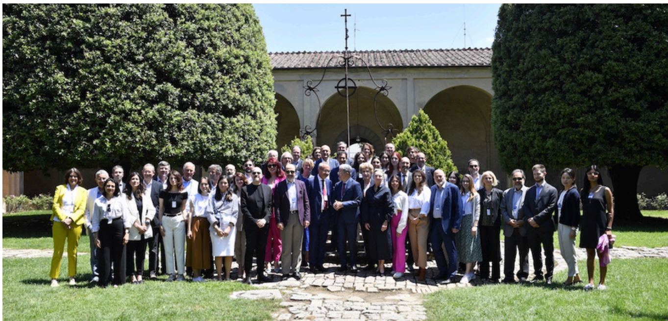
Siena Conference fourth Edition 2023.